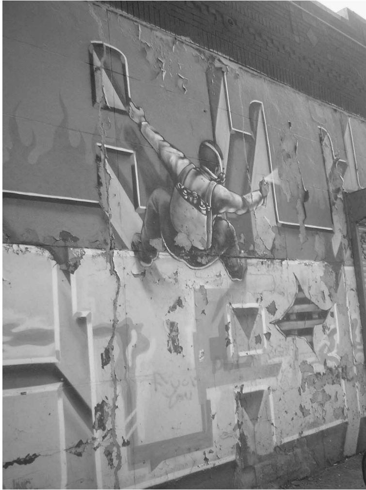
Figure 1 Tats Cru graffiti seen on the Bronx Soundwalk.

Street is my home. You might even see me walking by and not recognise me, but I still live here. I grew up here, this is my neighbourhood. I am going to take you on a tour. Enjoy. Now start walking towards the head of the station and remember to take the second turnstile. Remember, follow me, take your time, relax. Move with me. We are going hit the whole neighbourhood; we are going to see the best artists in the world. Tats Crew (music) ("Bronx Soundwalk: Graffiti" 2003)